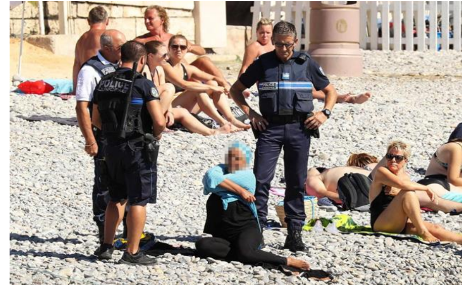
The Burkini ban in France, August 2016

GREASE Religion, Diversity and Radicalisation